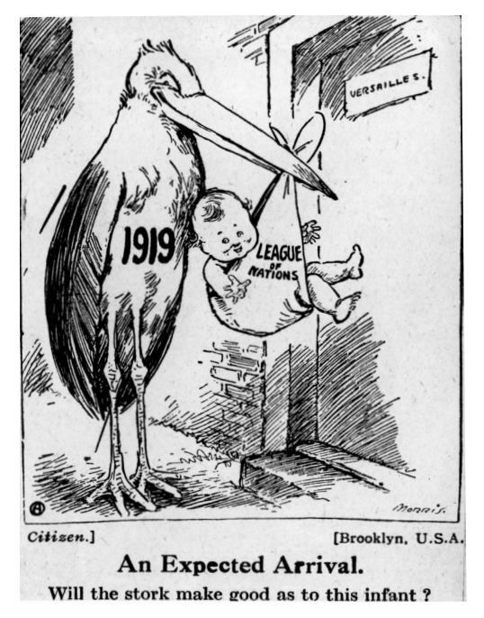
1919: A cartoon depicting the formation of the League of Nations after the First World War.