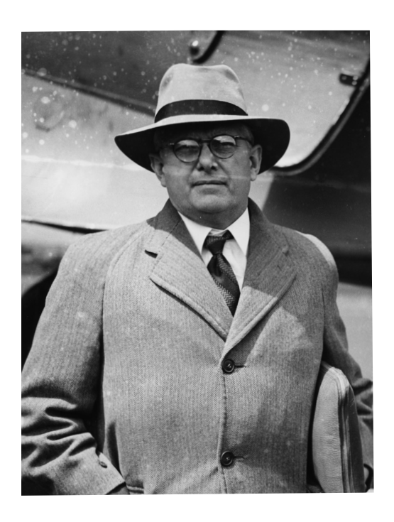
Australian politician Herbert Vere Evatt, former President of the United Nations General Assembly, circa 1955.

norms and purpose of the UN system were by and large compatible with U.S. interests and ideology. But U.S. leadership was discharged in other crucial ways, including making planning for the postwar world a wartime priority; allocating human resources to develop ideas; consulting extensively with other governments to build a critical mass of support; and organizing conferences where the structure, mandate, and operation of these organizations were hammered out. Allocating resources, providing logistical support, and cultivating multilateral cooperation were all essential elements of U.S. leadership.