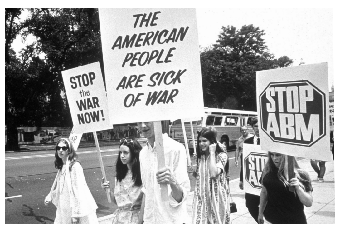
Students march with anti-war placards on the campus of the University of California at Berkeley, California, 1969.

hastened the erosion of the domestic consensus that had made Cold War internationalism possible in the first place. By the late 1960s, Congress was poised to slash U.S. troop commitments to the North Atlantic Treaty Organization (NATO), a threat that called into question the sustainability of the commitments that had made the Cold War order.<sup>58</sup>