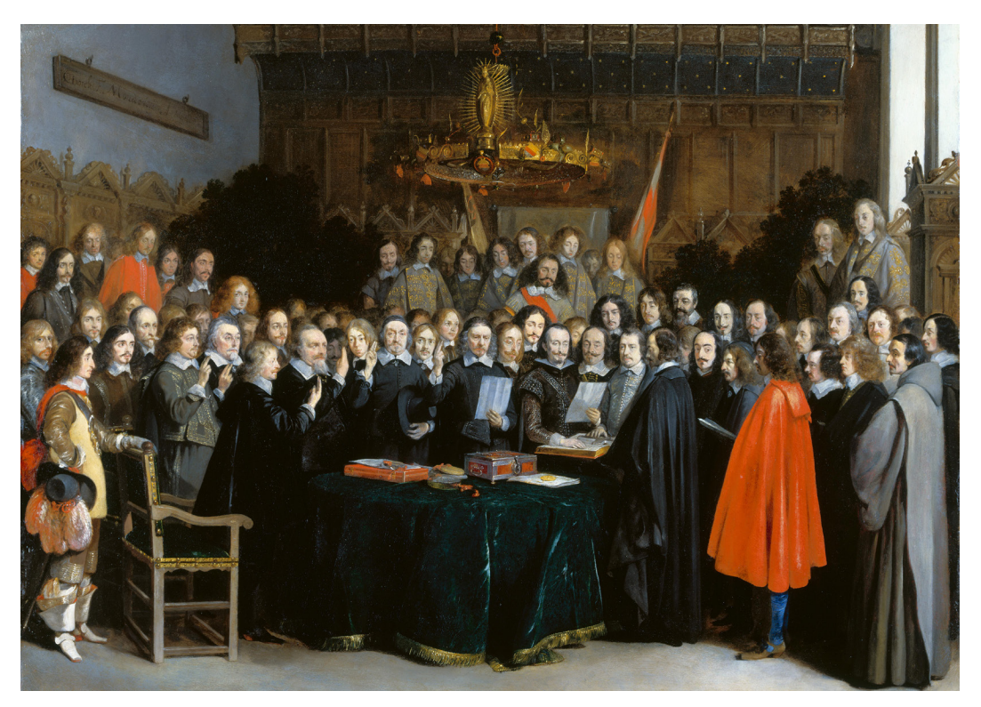
The ratification of the Treaty of Münster, Gerard ter Borch (1648).

retreating from the historical Westphalia, as some have suggested, it may be useful instead to take a fresh look at what the conference was, what it was not, and what guidance it can still offer to scholars and policymakers wrestling with the changing nature of global order today.