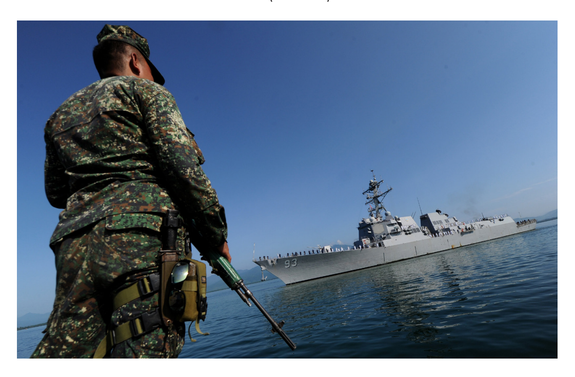
TOPSHOTS A Philippine naval personnel stands on quard during the arrival of missile destroyer USS Chung Hoon (DDG-93) before the US-Philippine joint naval military exercise entitled 'Cooperation Afloat Readiness Training' (CARAT) near the disputed Spratly islands, in Puerto Princesa on the western Philippine island of Palawan on June 28, 2011.