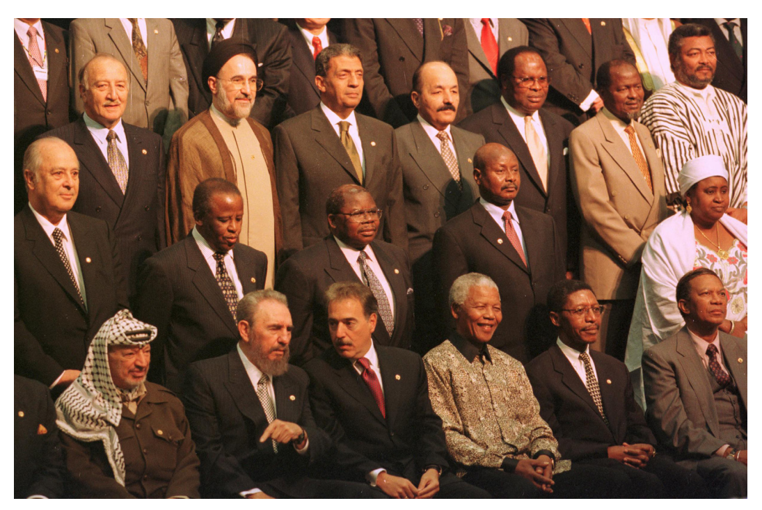
Heads of state and government and foreign ministers pose for the group photo opportunity at the 12th Non-Aligned Movement (NAM) summit in Durban 02 September.